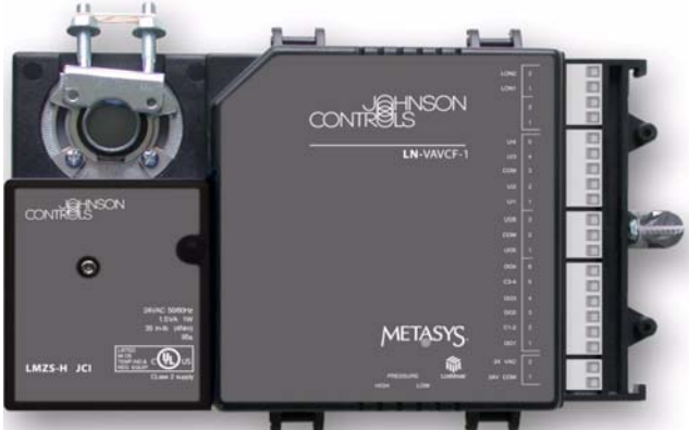
Figure 1: LN VAV Controller

The LN-VAVCF controller uses the LonTalk® communication protocol and is LONMARK® certified with the Sensor profile (#1) for input object and the Actuator profile (#3) for the output objects.