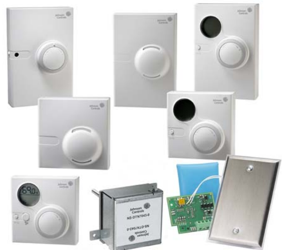
Figure 1: NS Series Network Sensors

Each network sensor includes an SA Bus access port to allow accessories to access the SA Bus. This plug allows accessories to service or commission the connected controller or gain access to any other controller on the same Field Controller (FC) Bus.